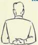
Illegal Forward Pass