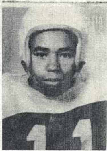
LOUIS POTTS Center