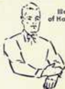
Illegal use of Hands or Arms