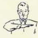
Illegal Motion or Formation at Snap