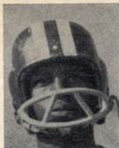
Ivan Woods Center