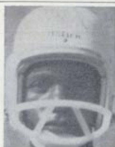
Robert Noble Center