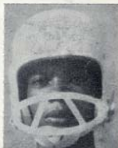
Tyrone Adams Back