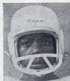
John Waddles Center